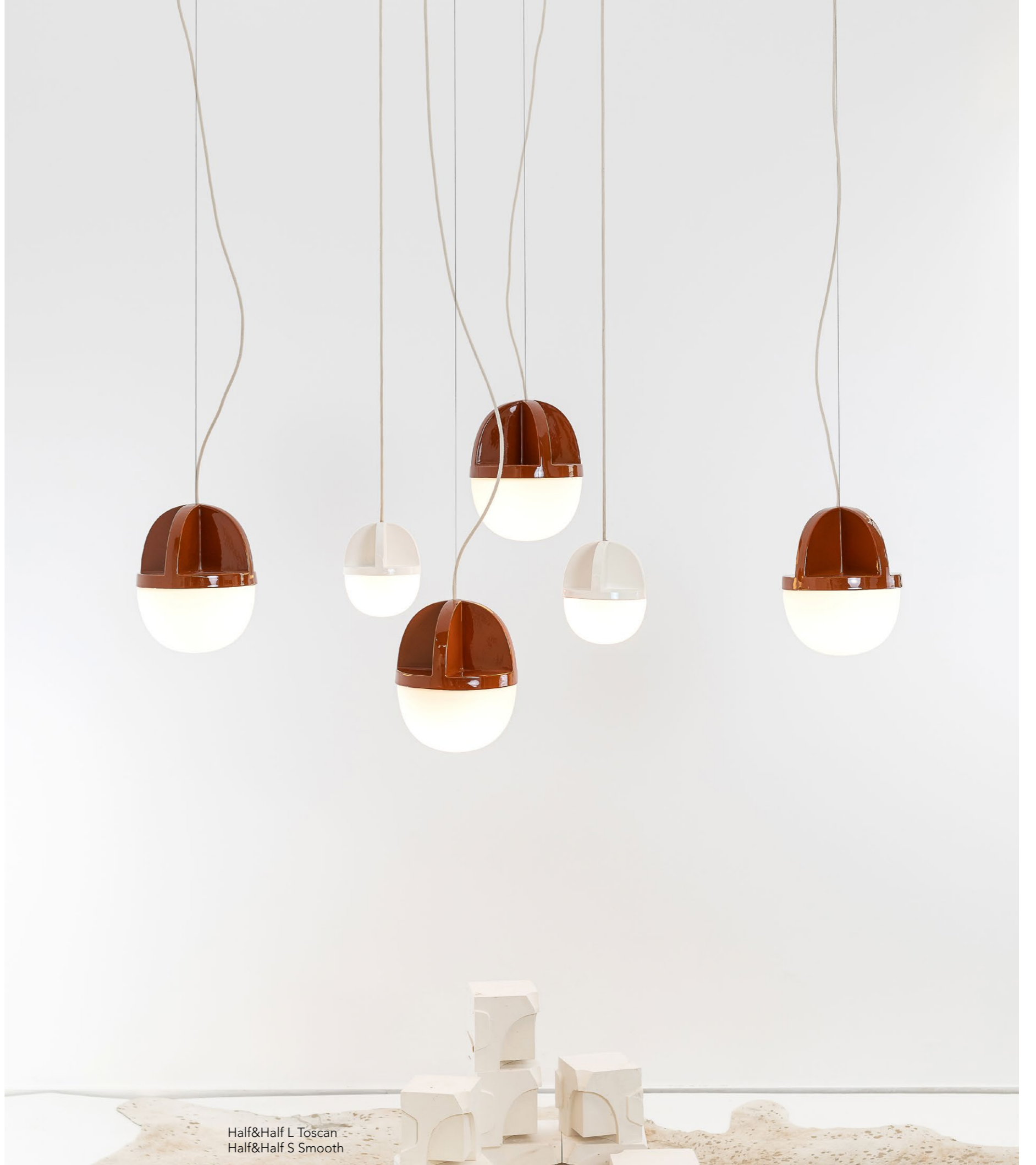
Half&Half L Toscan Half&Half S Smooth