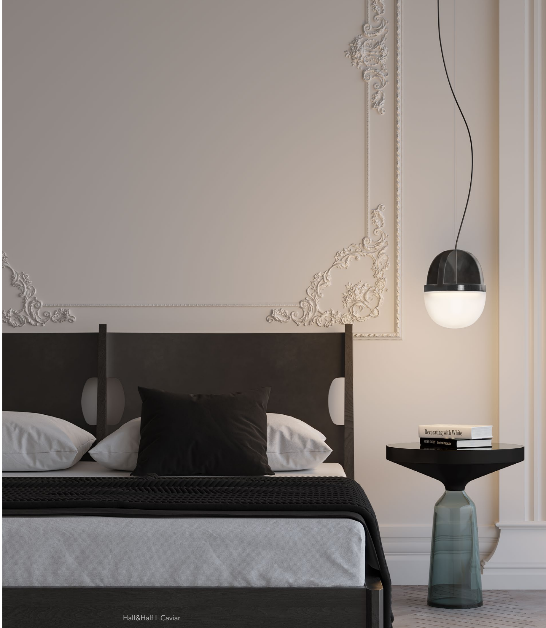
Half&Half L Caviar