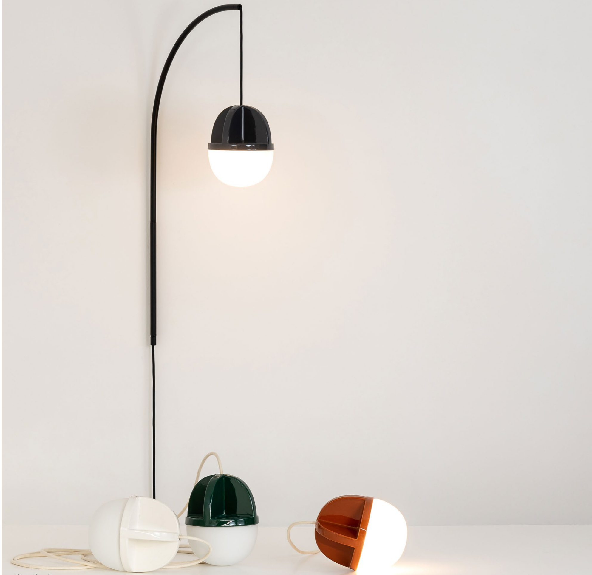
Half&Half wall Smooth-Green-Toscan